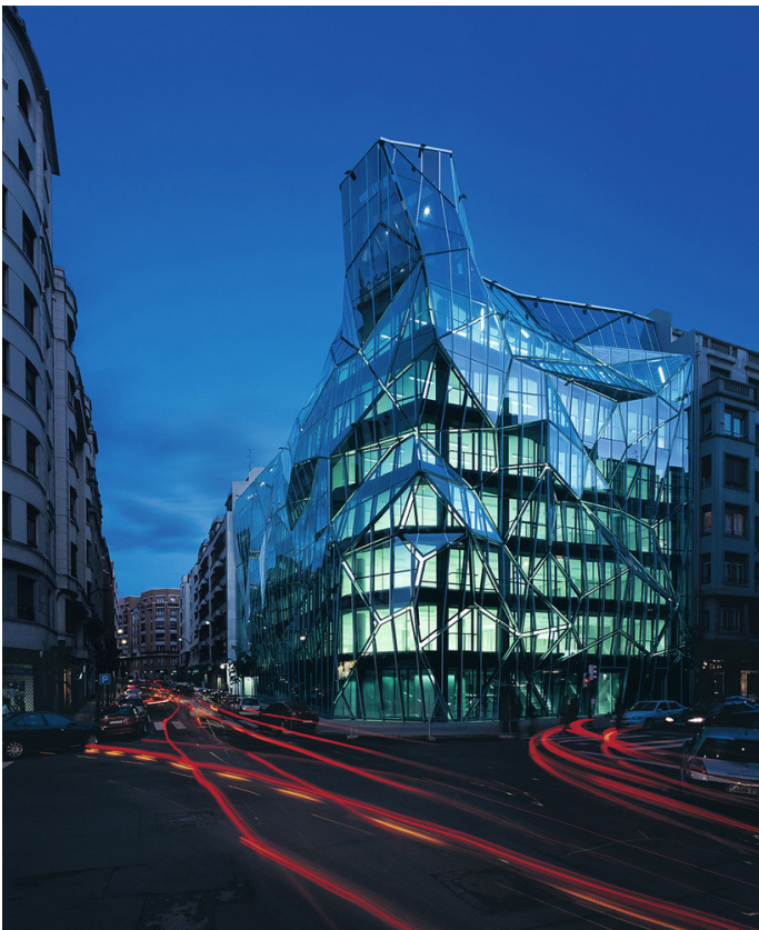
Basque Health Care building

Urban Surgery Projects and renowned Architects Projects visit